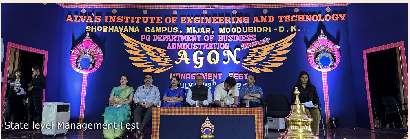
State level Management Fest