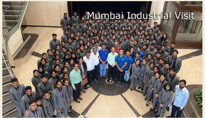
Mumbai Industrial Visit