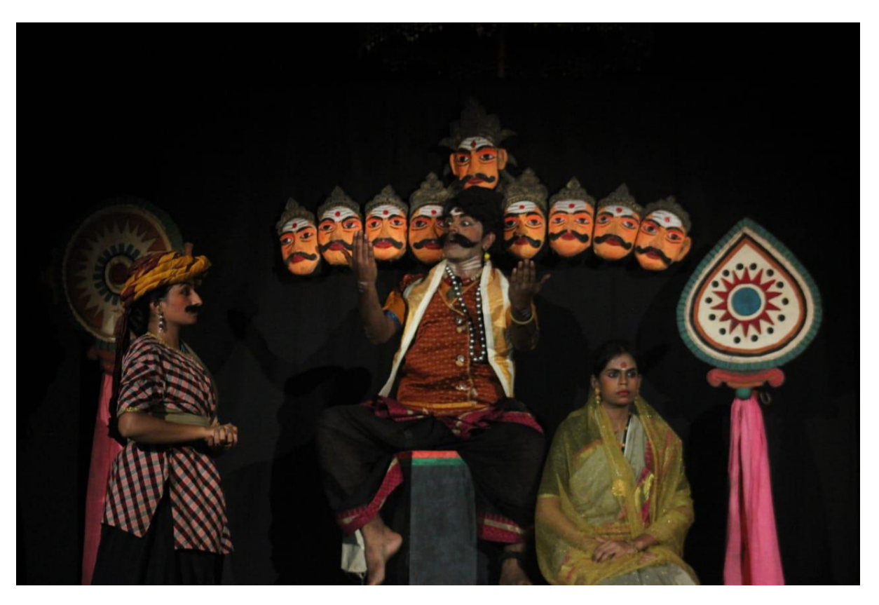
FOLK/TRIBAL DANCE - GOLD MEDAL