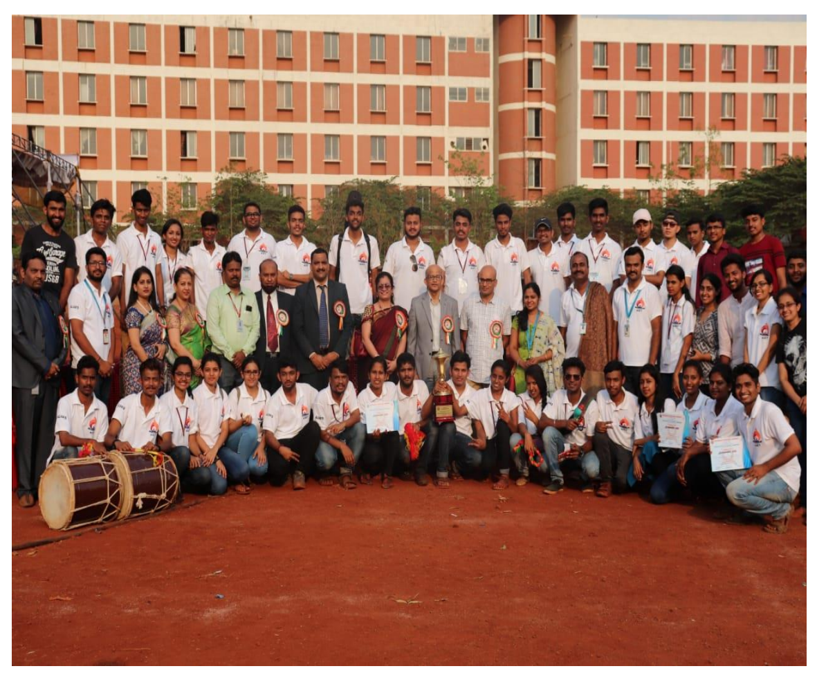
Our VTU Cultural team with Chief Guest, Organizing committee of University and Angadi Institute of Engineering, Belagavi after receiving TROPHY