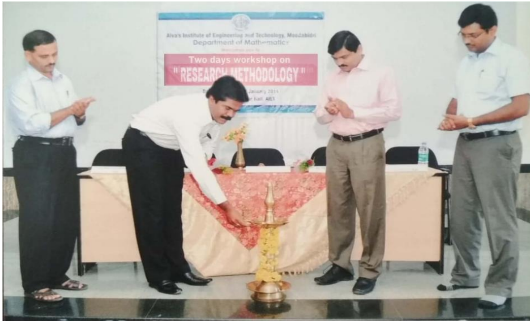
DURING INAUGURATION OF THE WORKSHOP