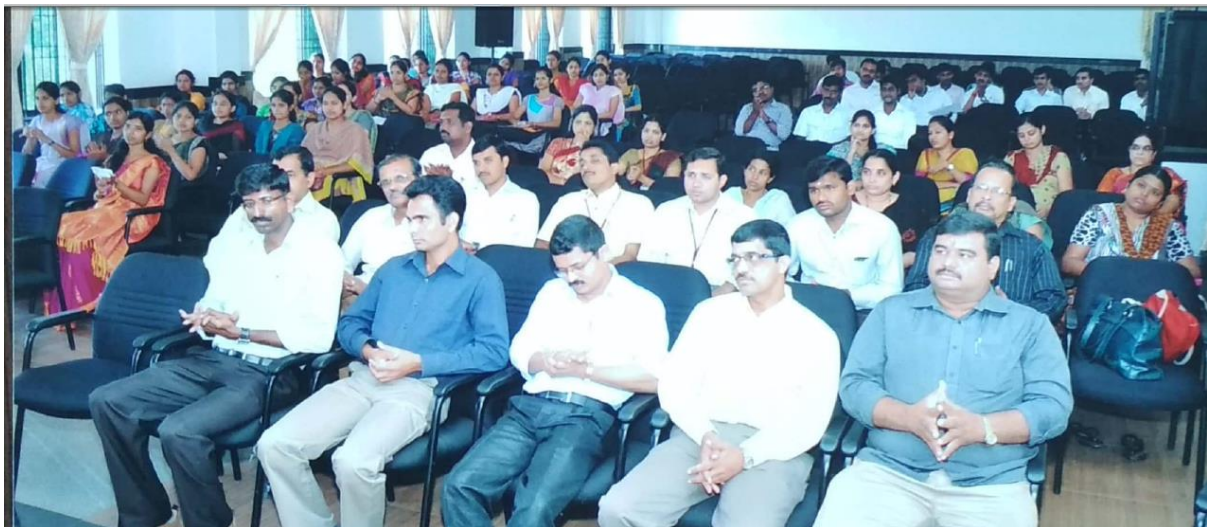
FACULTIES DURING INAUGURATION