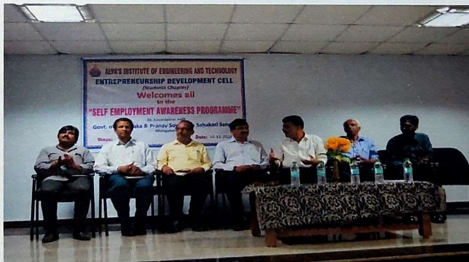
Guests on the dais during the inaugural Programme