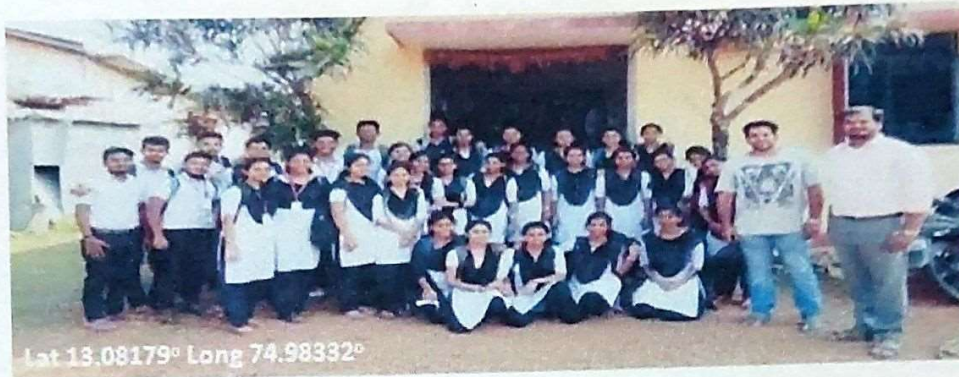
a. Group photo