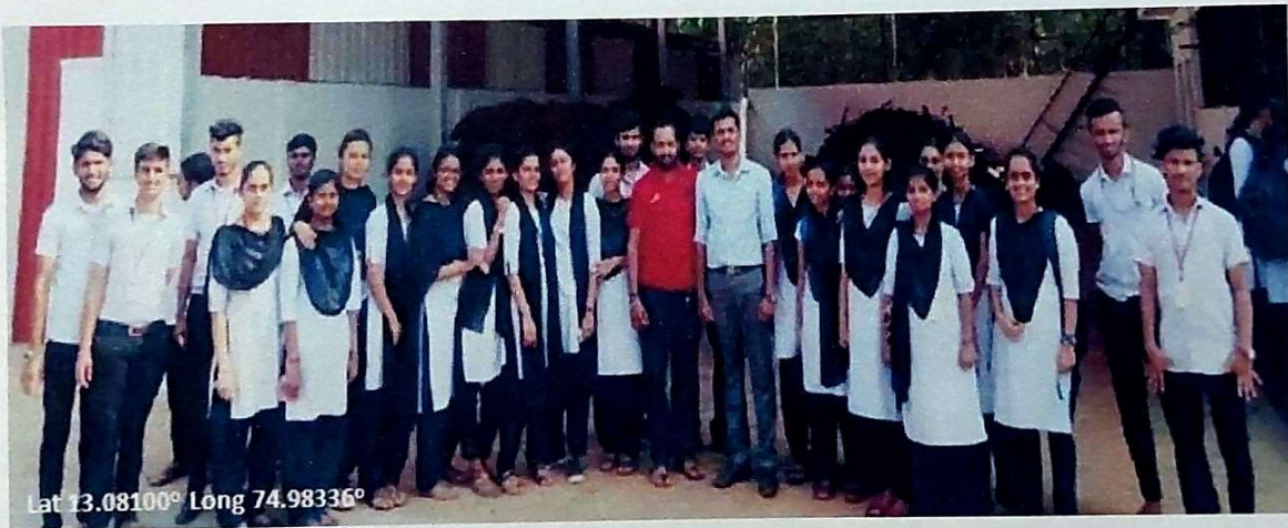
a. Group photo,