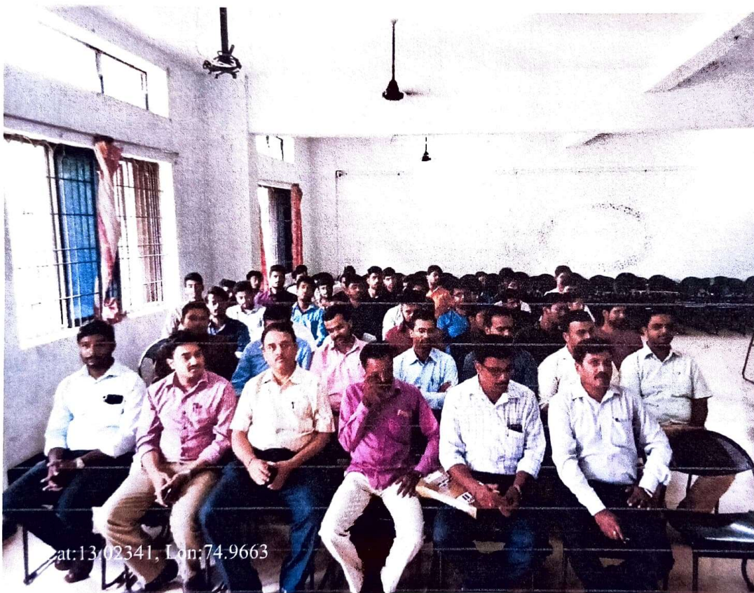
Faculty presence during the session

It was obtained from the first source of data . The primary data were more reliable and have a more confident level of decision-making with the trusted analysis having direct intact with occurrence of the events. The primary data sources are industries' working environment (through observation, pictures, and photograph) and industry employees (management and bottom workers) (interview, questionnaires and discussions).