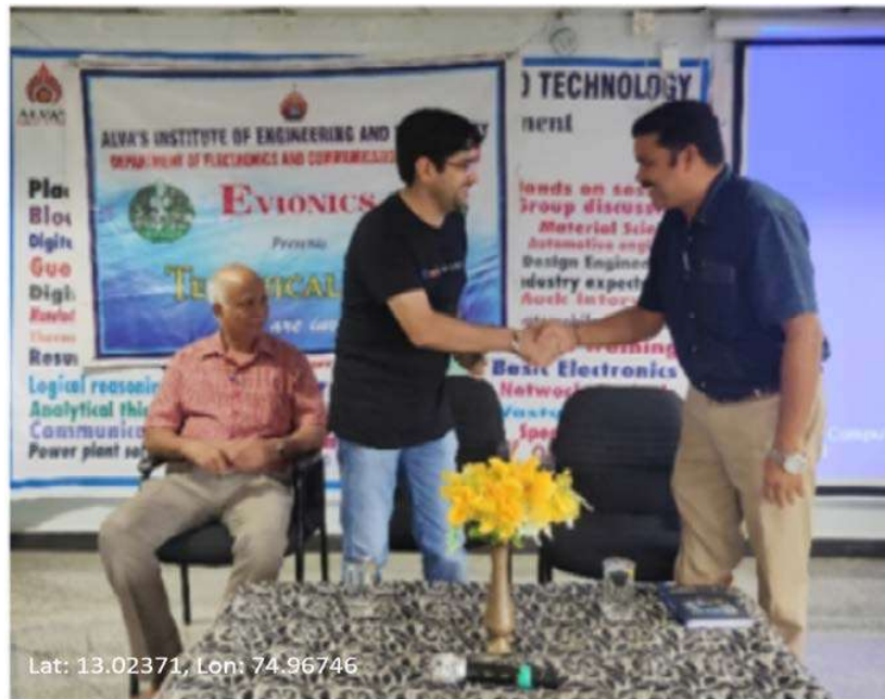
Welcoming Resource person for the talk