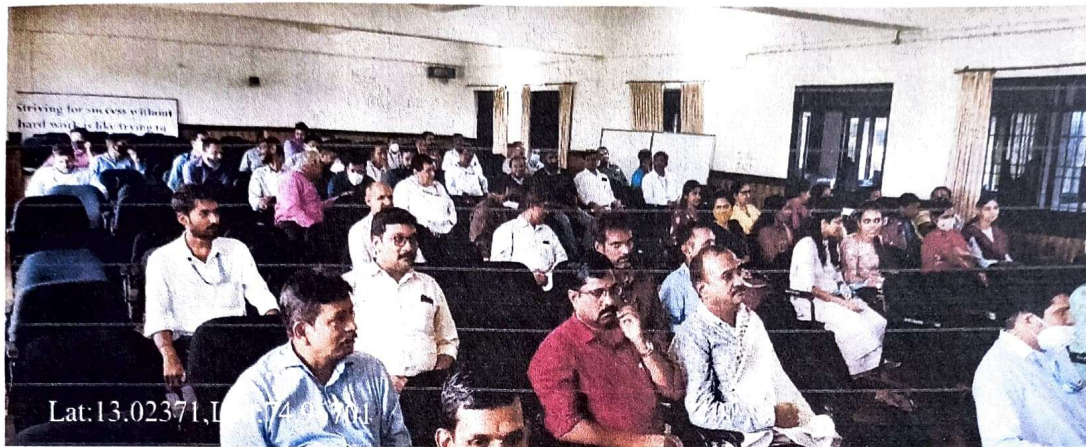
Faculties present during the session

Expedient to divide the main problem into appropriate sub-problems, all of which when resolved will result in the solution of the main research problem.