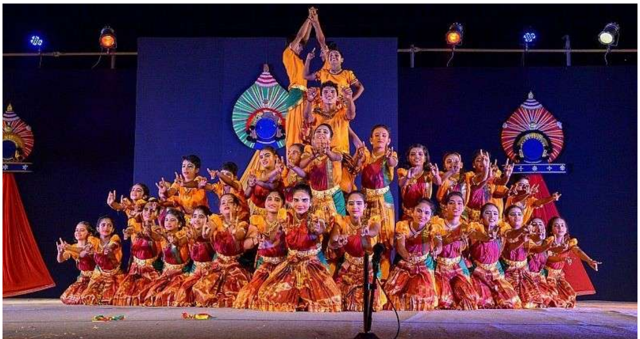
Students of AEF performing various stage events during Alva's Deepavali 2016.