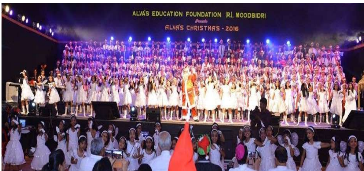
Students of AEF performing Coral song during Alva's Christmas 2016.