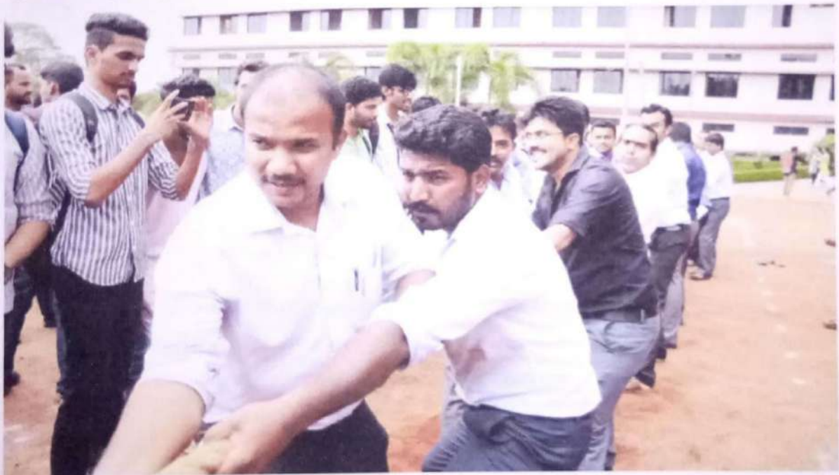
Faculties playing Tug of War.