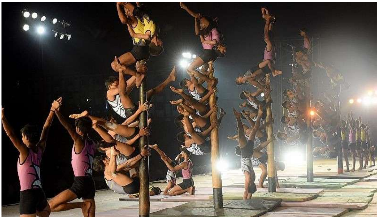
100 Students of AEF performing Mallakamba stage event during Alva's Deepavali 2016.