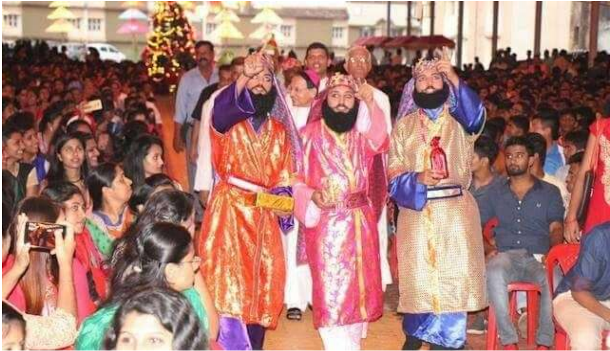
Procession during Alva's Christmas 2016.