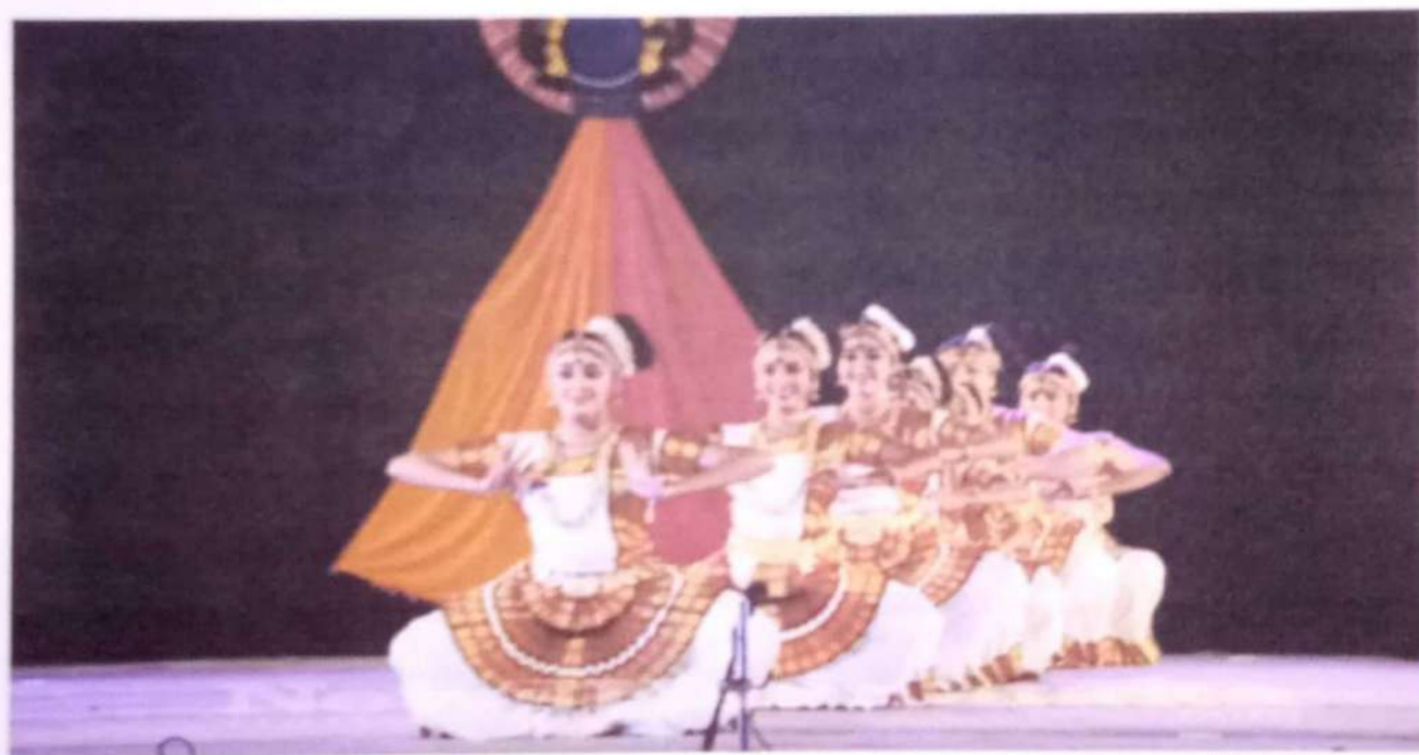
Students of AEF performing various stage events during Alva's Deepavali 2016.