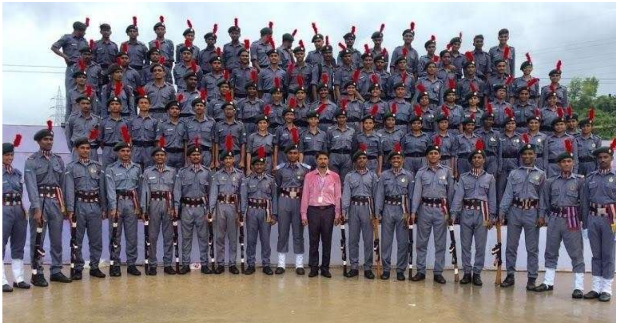
NCC Cadets participated in Independence Day – 2016.