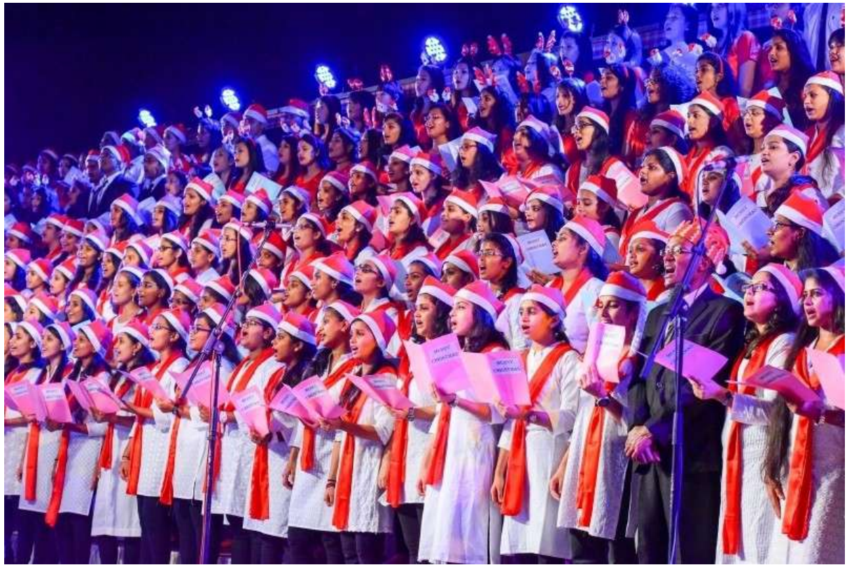
Students of AEF performing Coral song during Alva's Christmas 2016.