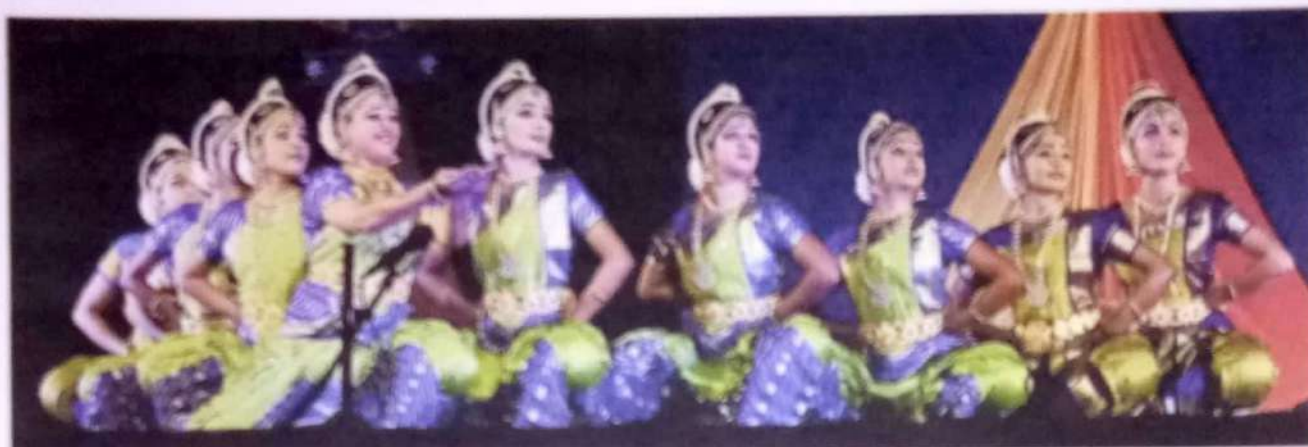
Students of AEF performing various stage events during Alva's Deepavali 2016.