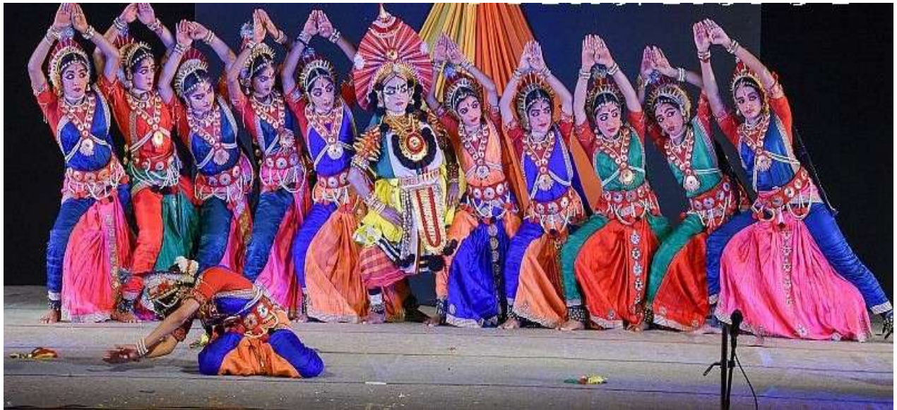
Students of AEF performing various stage events during Alva's Deepavali 2016.