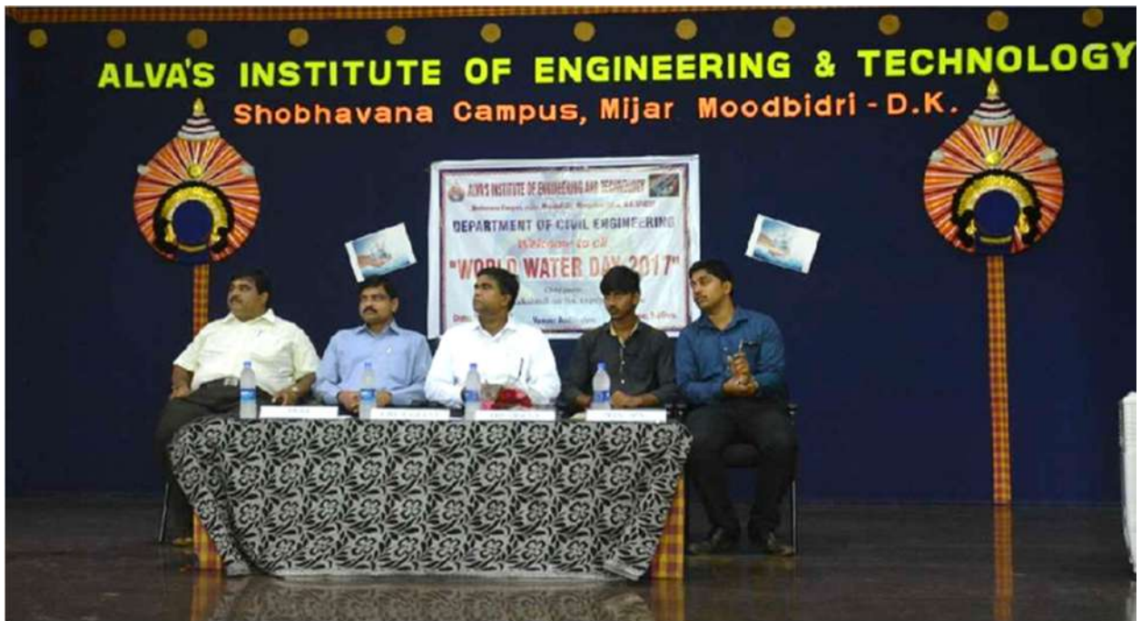
In Inaugural function of World Water Day – 2017 dignitaries on dais.

A technical talk on “World water day-2017” presented by the resource person. He said World Water Day is an annual event celebrated on 22 March.