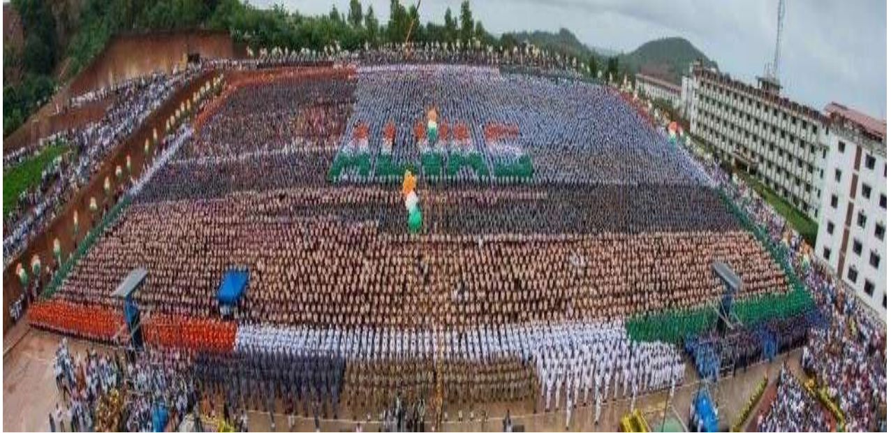
Arial view of .Independence Day – 2016.

All Cadets of Flt- B Air Wing NCC along with Army wing, Navy wing and Students of all AEF colleges along with entire foundation staff celebrated Independence Day on 15 Aug 2016.