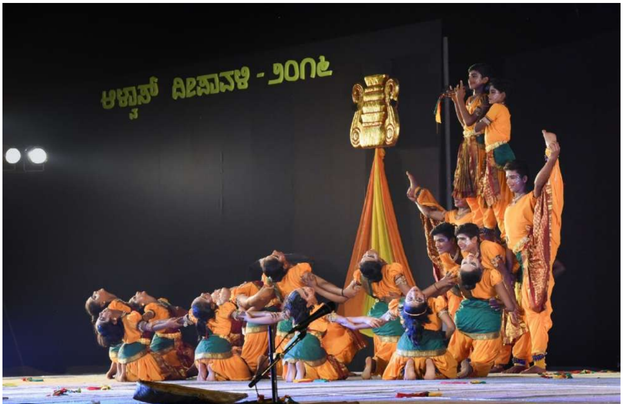
Students of AEF performing various stage events during Alva's Deepavali 2016.