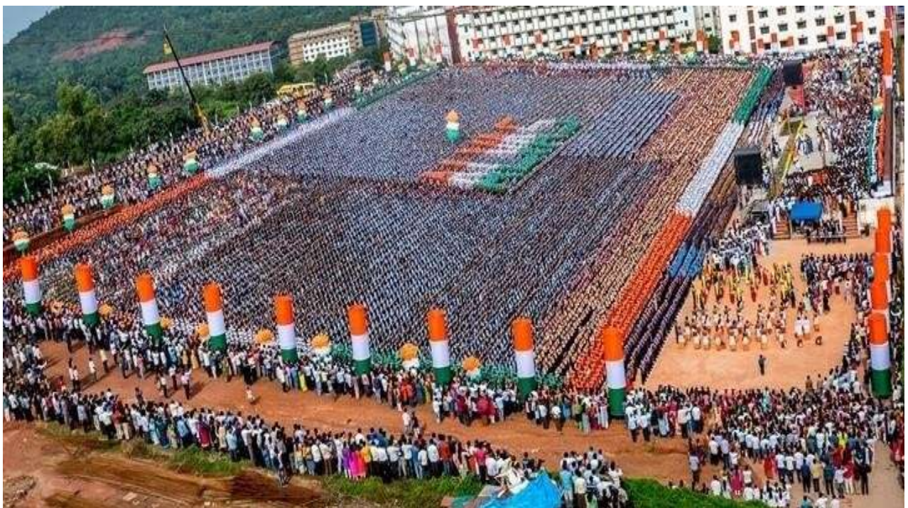
Around 30,000 people participated in Independence Day - 2016 at Smt. Vanajakshi K. Srepathi Bhat Bayalu Ranga Mantapa Puthige.