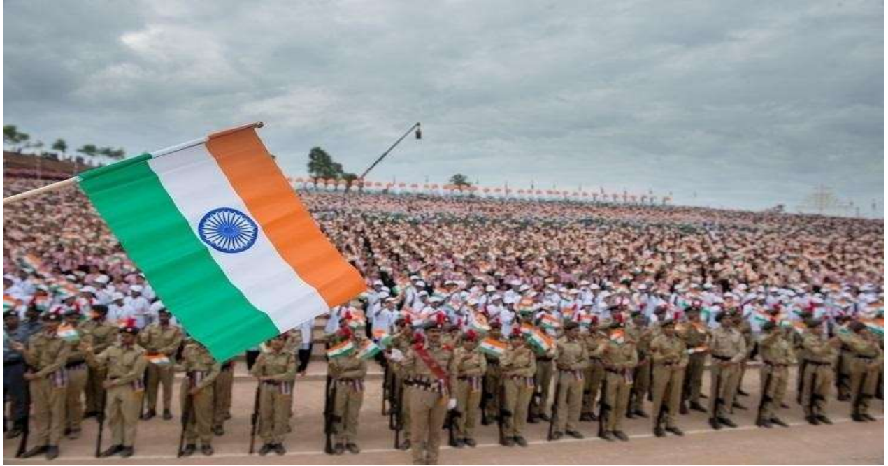
NCC Cadets at Republic Day – 2017.

All Cadets of Flt- B Air Wing NCC along with Army wing, Navy wing and Students of all AEF Colleges along with entire foundation staff celebrated Republic Day on 26 Jan 2017.