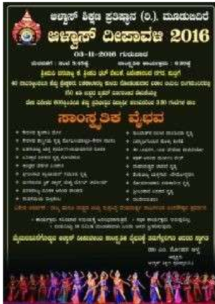
Invitation of Alva's Deepavali – 2016.

Celebrations began with an attractive procession of different cultural troupes moving ahead of the dignitaries. There were Puthani, Kombu, Chende, dolu, Vadya, Srilankan instrumental troupes and many more in the procession.