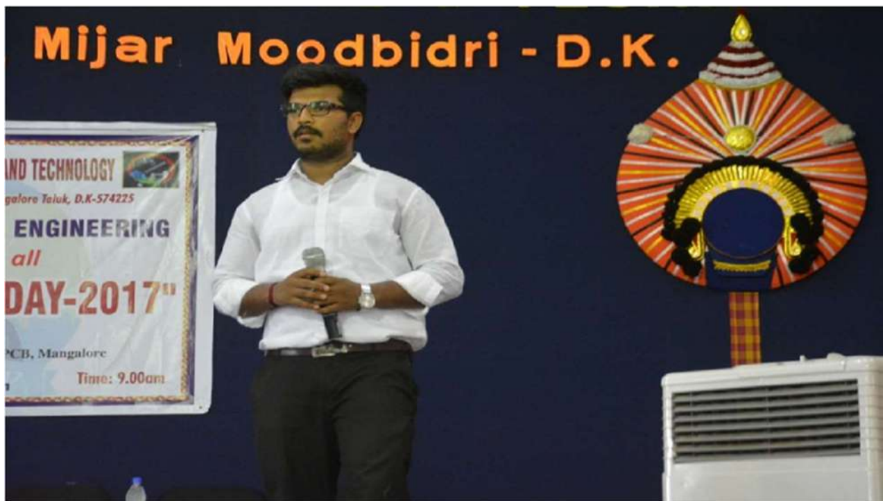
Resource person addressing the gathering.

A technical talk on “World water day-2017” presented by the resource person. He said World Water Day is an annual event celebrated on 22 March.