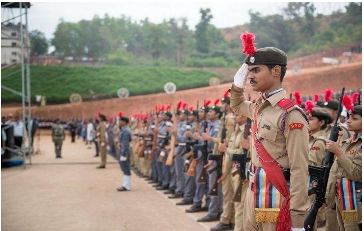
NCC Cadets participated in Republic Day – 2017.