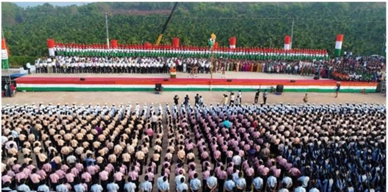
Around 20000 people attended the program.