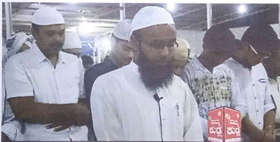
Mass Namaz at Alva's Ifthar Koota 2017