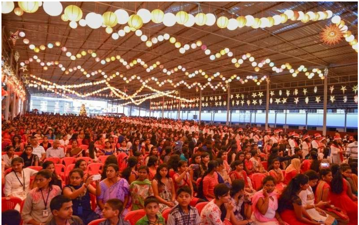
Nudisiri Vedhike Stage decorated with colorful lamps at Alva's Christmas 2016.